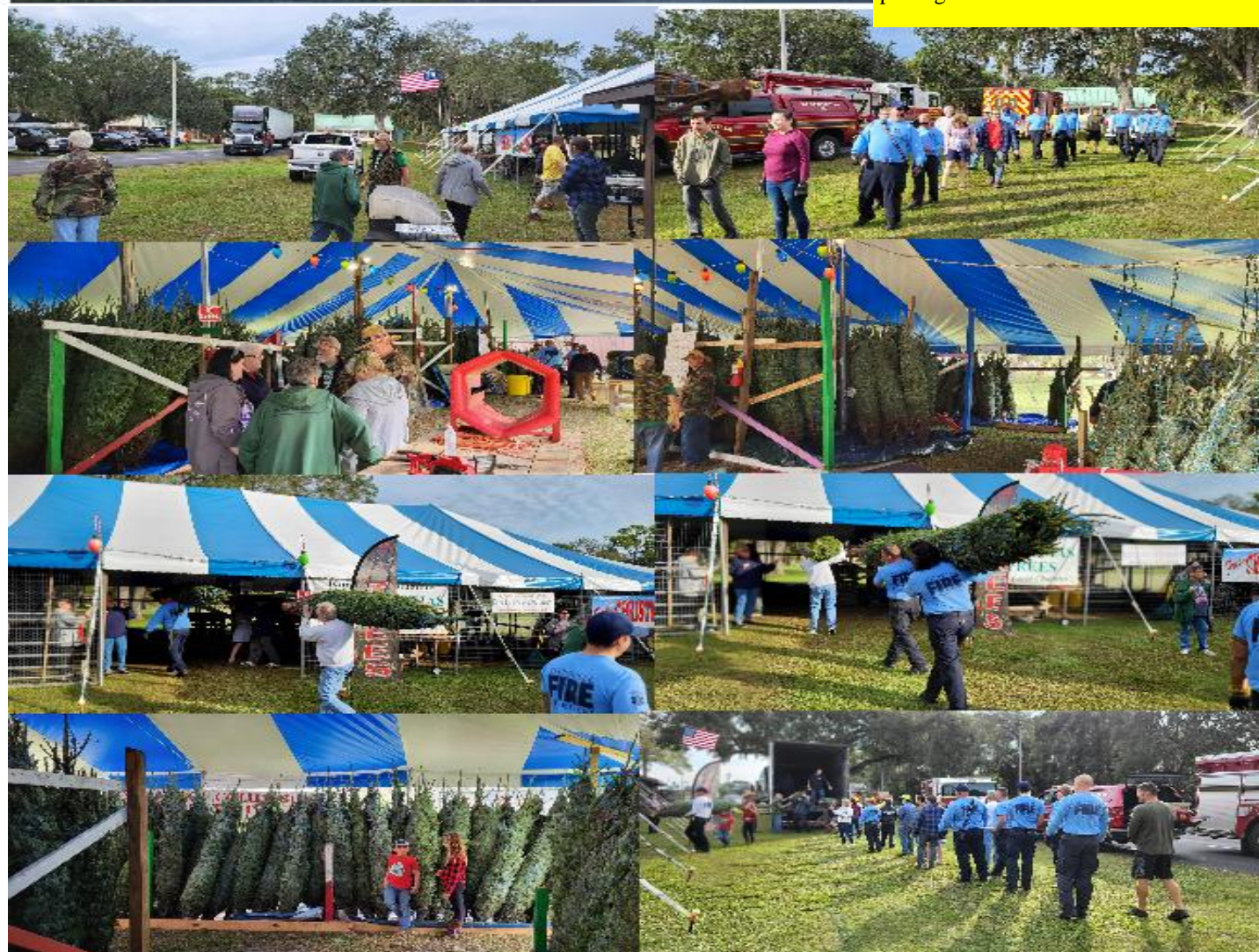
Christmas Tree Truck unloading and putting them into the Tents