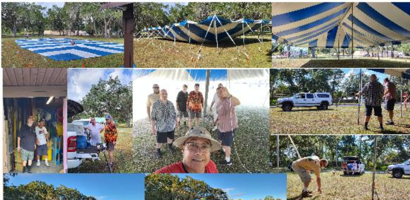
Christmas Tree Tent Setup